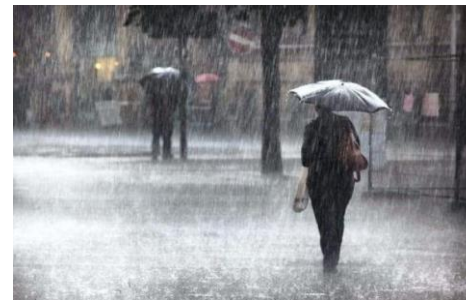
r a i | n i n g raining