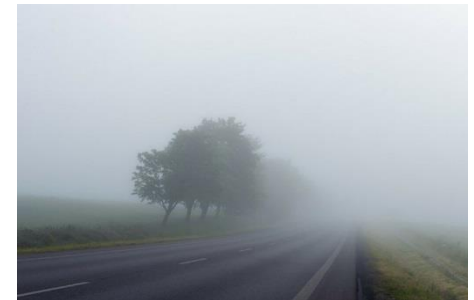
f o | g g y foggy