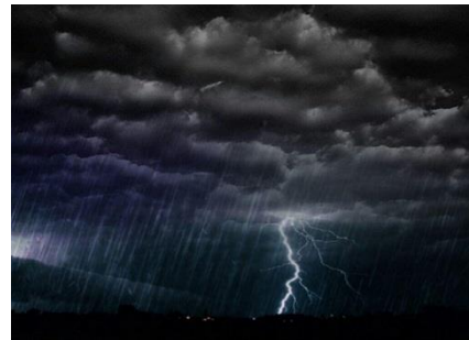
th u n | d e r | s t o r m thunderstorm