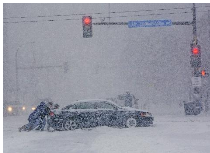
bl i | z z a r d blizzard